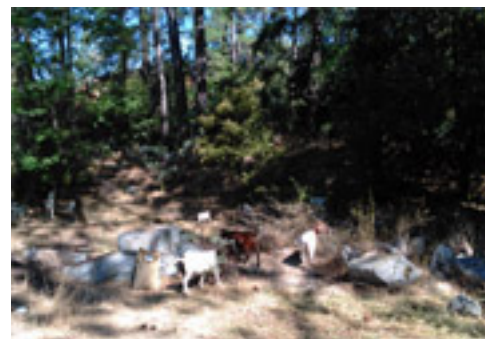
Goats Eating Brush along Hwy 49

I love where I live both the physical beauty of it and the kind, friendly people that share our road.