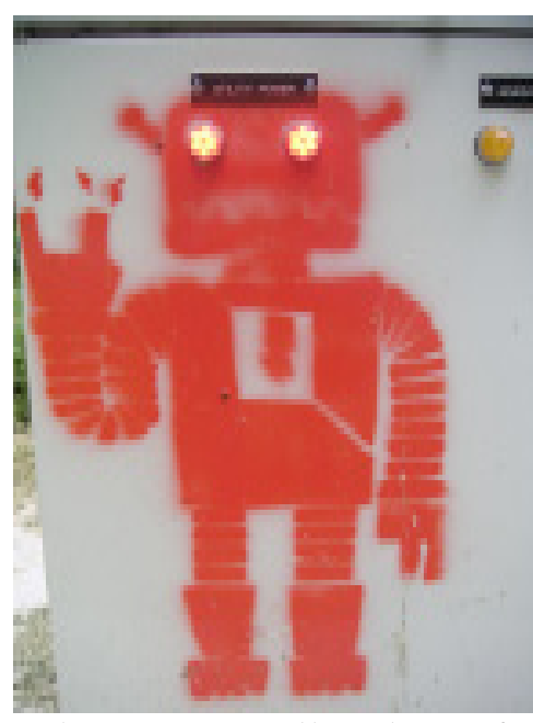
Local artist creates a new neighbor on the corner of Cement Hill Road and Augustine Rd.!