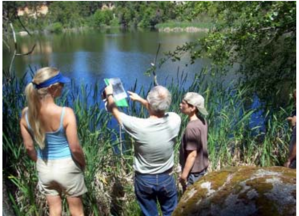
History Lesson at Hirschman's Pond.