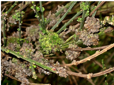
The Broom Gall Mite

The good news about the gall mite is that it attacks Scotch Broom by forming small growths on the plant buds which greatly reduces the ability for it to grow and reproduce. In some areas, the gall mite has even killed large stands of Broom. Native to Europe, the mite was first found on Scotch Broom in Western Washington and Oregon. Although the mites are nearly invisible to the naked eye, the small growths that the plants make in response to the mite activity is quite noticeable. The small fuzzy masses occur along the length of the stem and can be quite numerous.