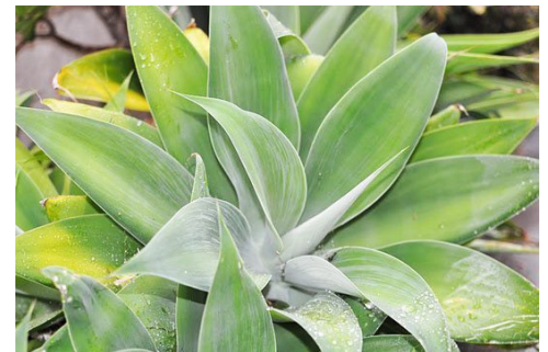
Elephant's Food (Portulacaria afra)

Incorporating fire safe methods into residential landscaping is proven to be an effective tool in slowing down the spread of fire. It is one of the most important ways you can help your home survive a wildfire. And, it is one of the most easily modified ways to reduce your risk. For more firewise information, visit these websites: http://cagardenweb.ucanr.edu/General/Landscaping_for_Fire_Protection/ & www.areyoufiresafe.com