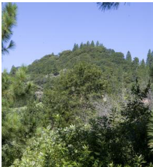
Sugar Loaf Mountain.