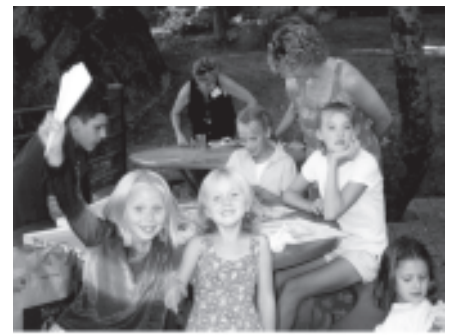
The kids program was a success.

GCHNA August 2000 Survey Results & Comments: http://www.gchna.com/survey