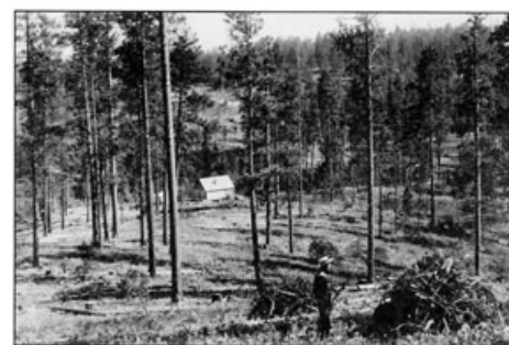
1909 Tree Coverage.

So, what can you do right now to reduce risk for beetle damage and fire hazard?