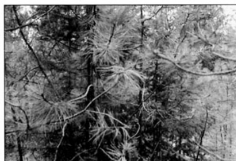
1997 Tree Coverage. A healthy forest should have 60 trees per acre. Many of our forests today are choked with young trees.