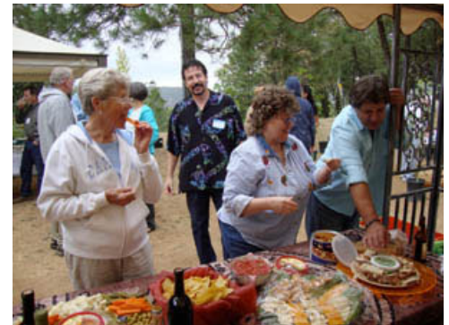
20th Annual Neighborhood Family Picnic.