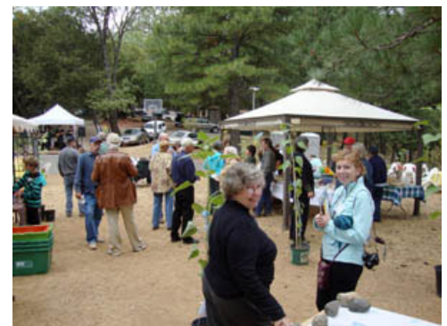
20th Annual Neighborhood Family Picnic.