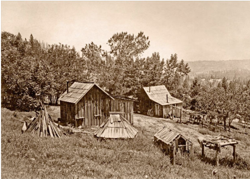
1907 Photo of the Nevada city Rancheria "Campoodie" Located on Cement Hill, in Nevada City, CA.