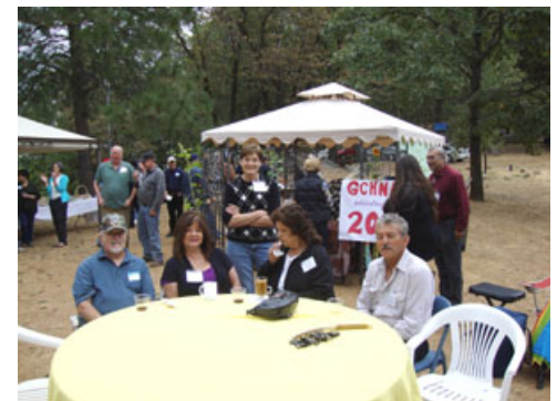
Nevada City Rancheria Honored Guests.

If you need emergency service during severe weather conditions call any of our Neighborhood Representatives for assistance.