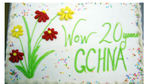
Cake Donated by Flour Garden Bakery.