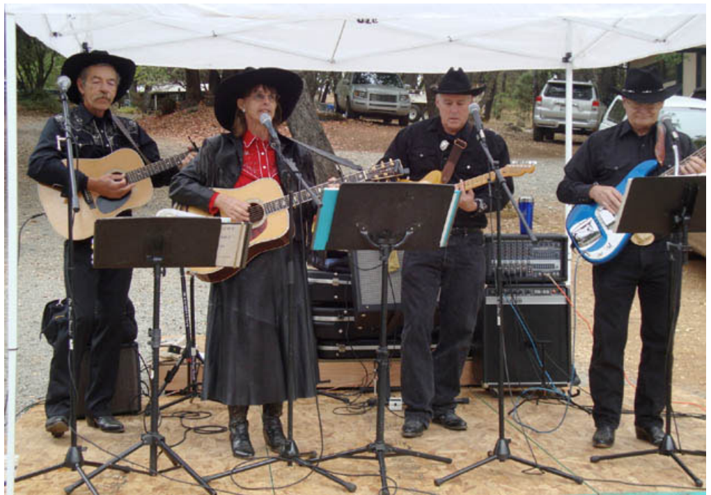
Country Comfort Band.