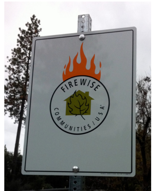
Greater Cement Hill Firewise Community Boundaries

USAA to reduce premium costs for customers within recognized Firewise Communities. We have also included the Emergency Fire Exit Road at the end of Cement Hill Road which extends across private property (Riverhill Farm) to Cedarsong Road. Thanks are given to Bill Holman for redrawing this map to make the map easier to read – both in print and electronically. For graphic simplicity not all roads within the community are labeled and shown but the critical boundaries are well defined.