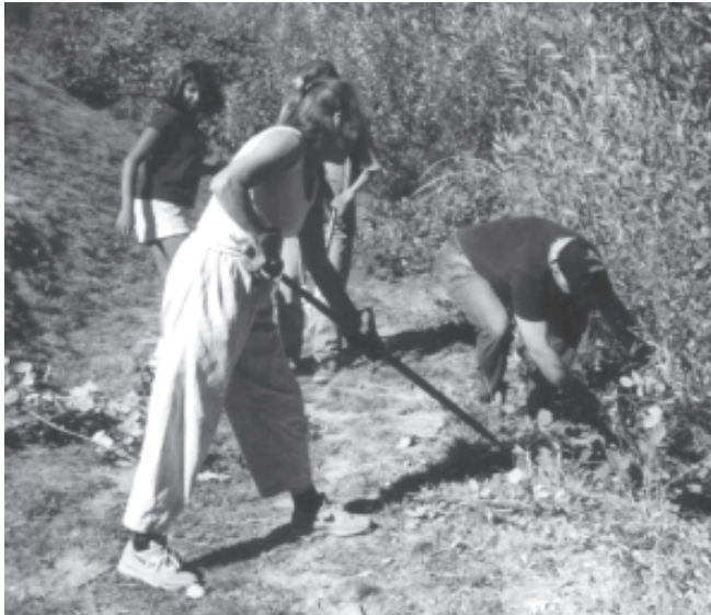
Join your neighbors in keeping Coyote Park clean.